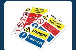
IMO symbol mark