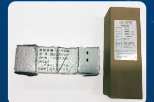
Emergency ration food