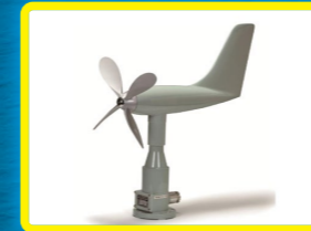
Wind direction and anemometer