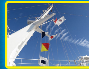
Maritime signal flags