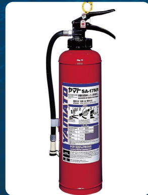
Fire extinguisher system