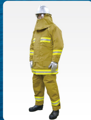
Heat-resistant fireproof clothing